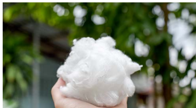
Recycled polyester fibres