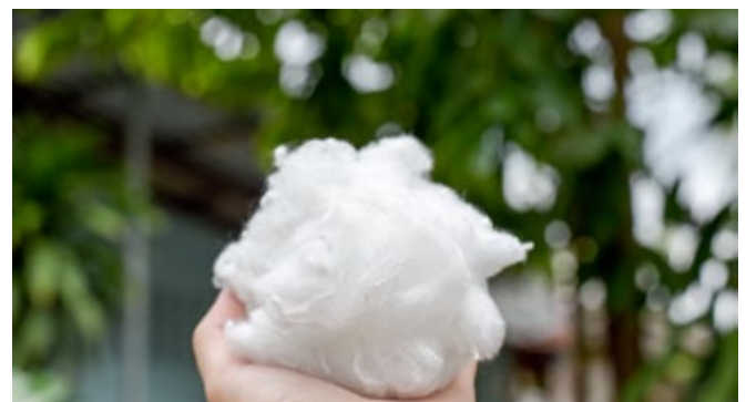
Recycled polyester fibres